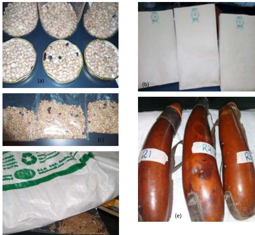
Figure 1. Storage materials; (a) glass bottles, (b) cellulose paper bag; (c) polyethylene bags; (d) hermetic grain storage bags; (e) gourds.

experiment two; polyethylene bags, cellulose paper bags, and gourds in both experiments (Table 1).